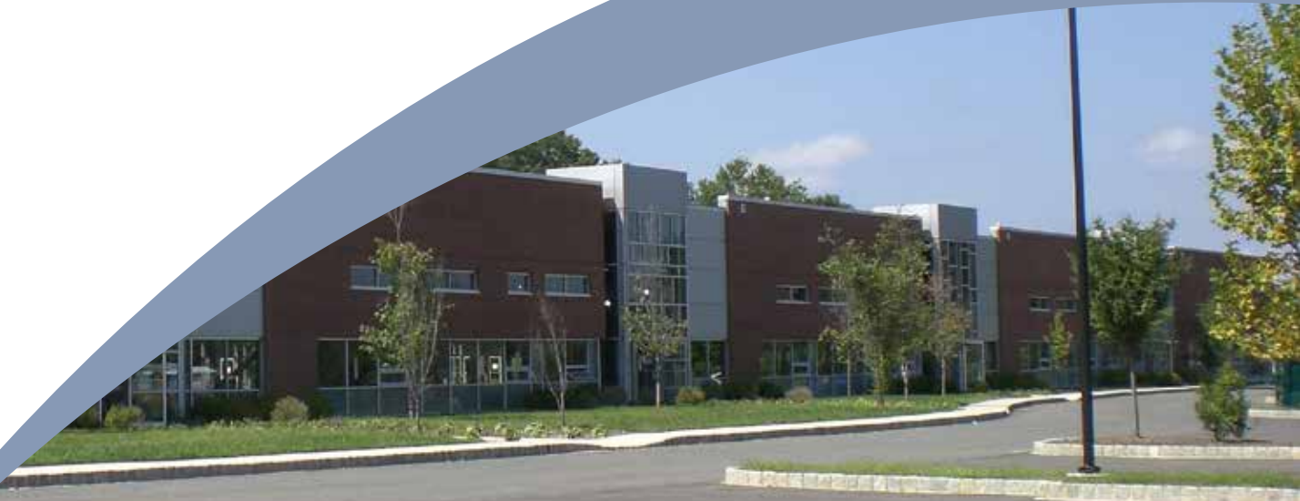
Building I - Fully leased